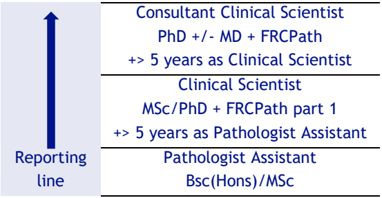
Figure 2: Clinical Scientist pathway

However, the current definition does not consider PhD graduates of non-clinical subjects such as education or management. It would seem imprudent to label these members as clinical scientists in view of their specialist subject.