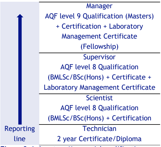
Figure 3: Laboratory Managerial qualifications

Many of the current offerings do not offer the same flexibility, but the main benefit to the societies is that all of the expenses are borne by the universities. The online management programs only need minimal oversight and maintenance which is centralized to ensure relevancy and reduced costs. They only need to conduct the oral exam for prospective fellows who have completed the pre-requisites.